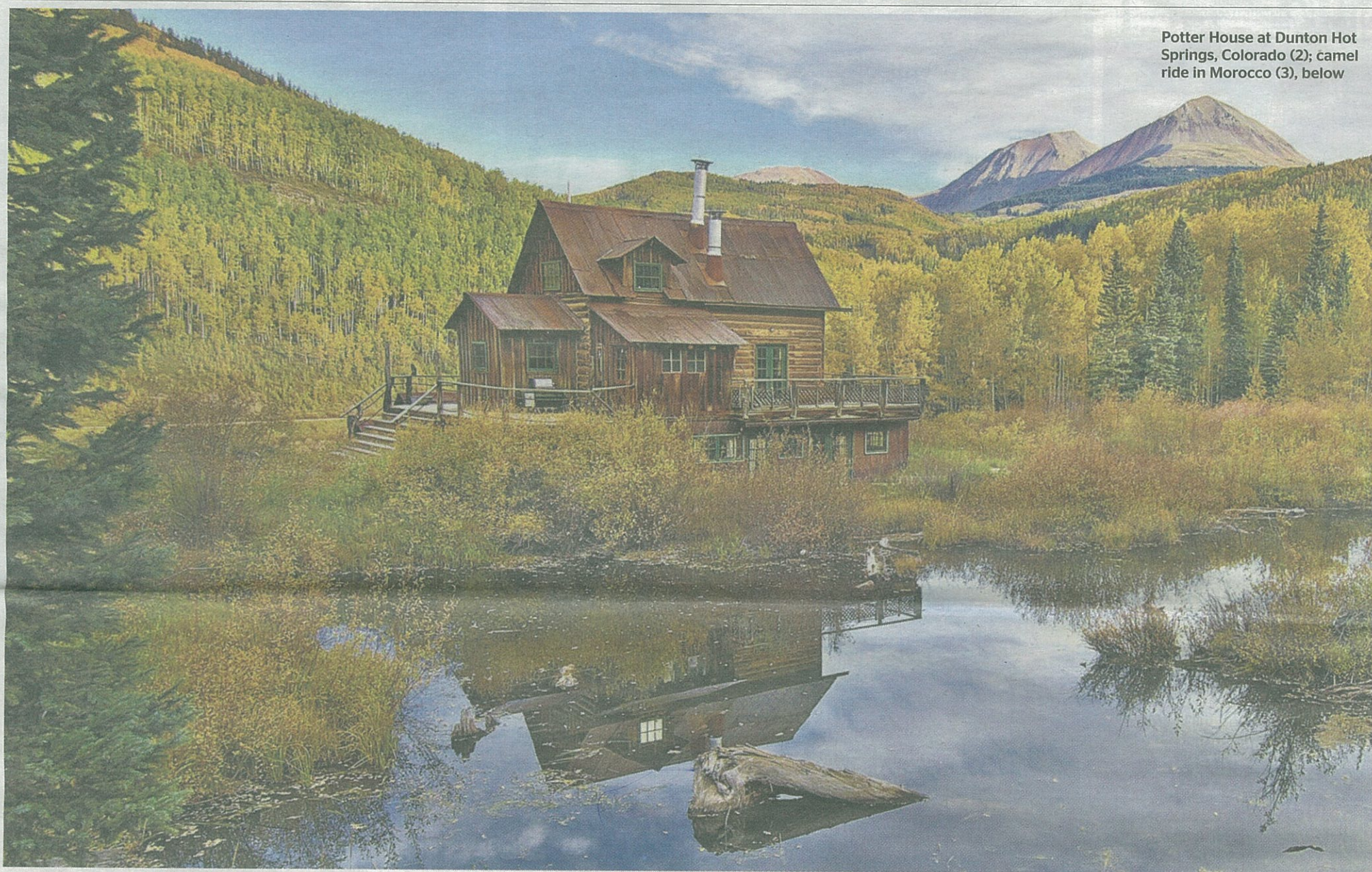
Potter House at Dunton Hot Springs, Colorado (2); camel ride in Morocco (3), below

John Bungey and daughter go on a road trip